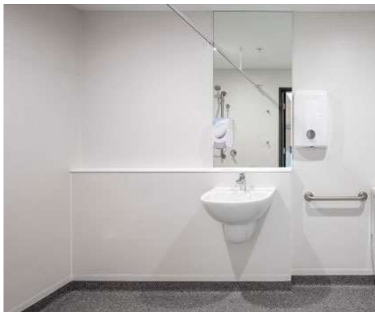
Figure 1 Accolade Foothold