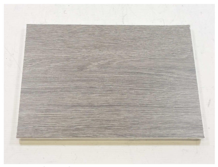
A001: Water Resistant Laminate