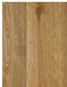
Stony Bay 21