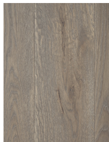
Mt Ruapehu 22