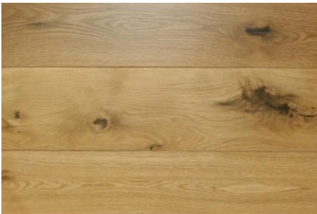
Rustic (CDE) Filled knots and end splits Available in 15 mm, variable bandsawn