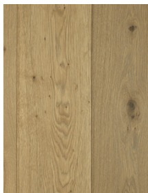
Mt Difficulty 06