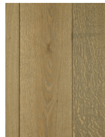
Te Paki Sands 07