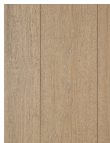
Fairy Falls 24