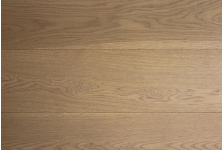
Prime Grade (AB) Clean boards with minimal knots Available in 15 mm and 20mm