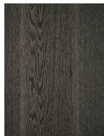
Lion Rock 13