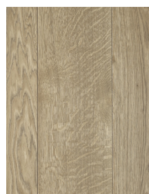
Abel Tasman 04