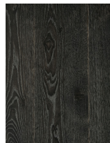
Iron Sands 14