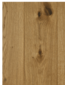
Tara Iti 16