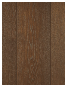
Ka Pai 15