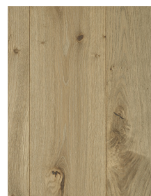
Tasman Glacier 10