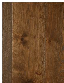
Kauri Cliffs 20