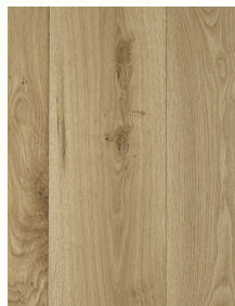
Golden Bay 05