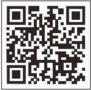
Visit the site