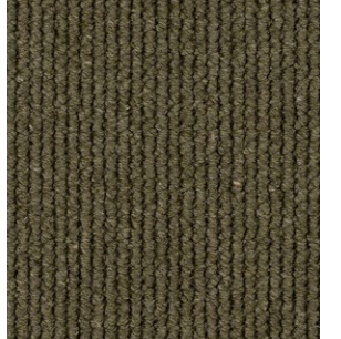
Frosted 5488 Harmony 5411