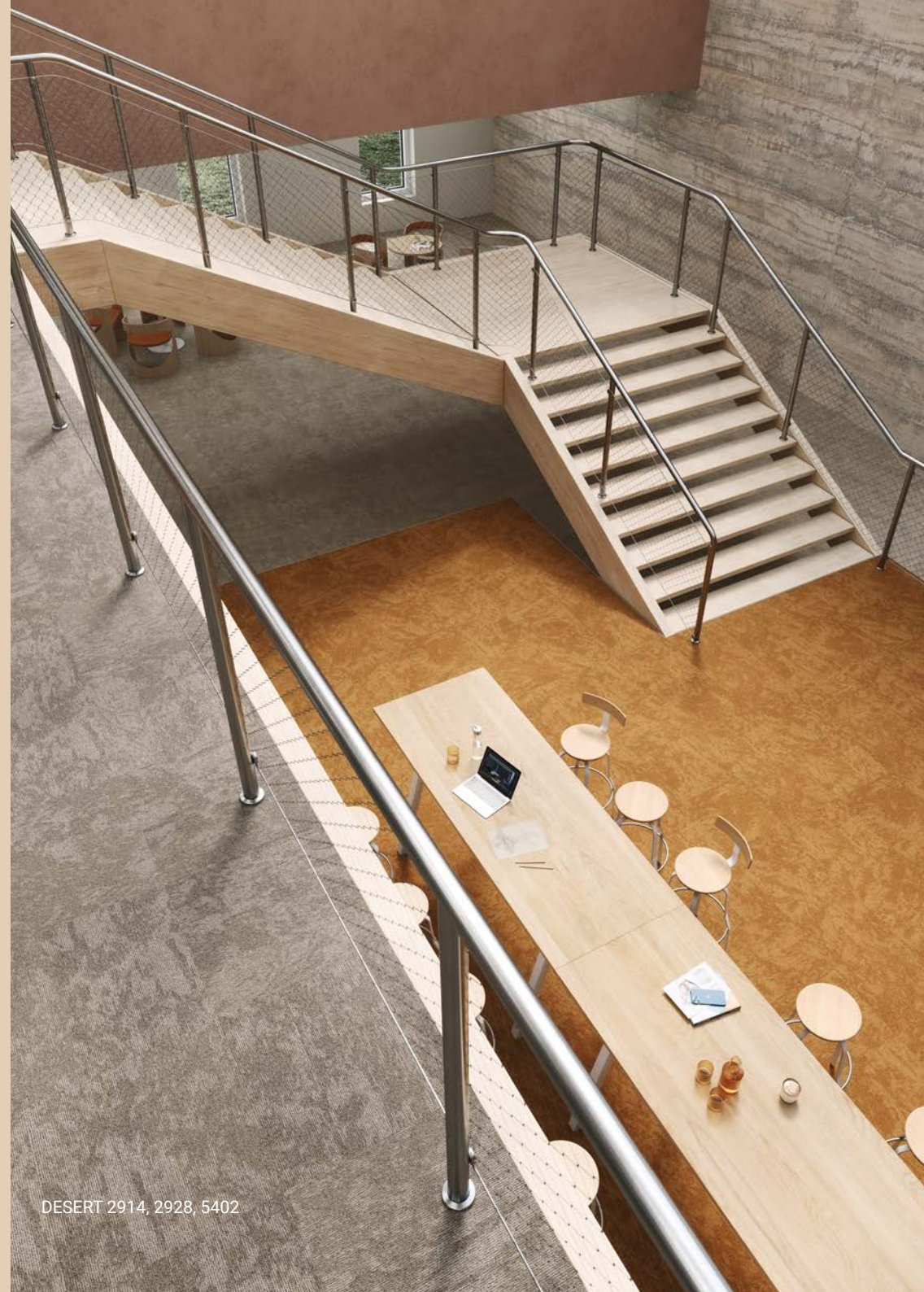
DESERT 2914, 2928, 5402

Whether your commercial interior project is compact or spacious, the end result is stylish, contemporary flooring.