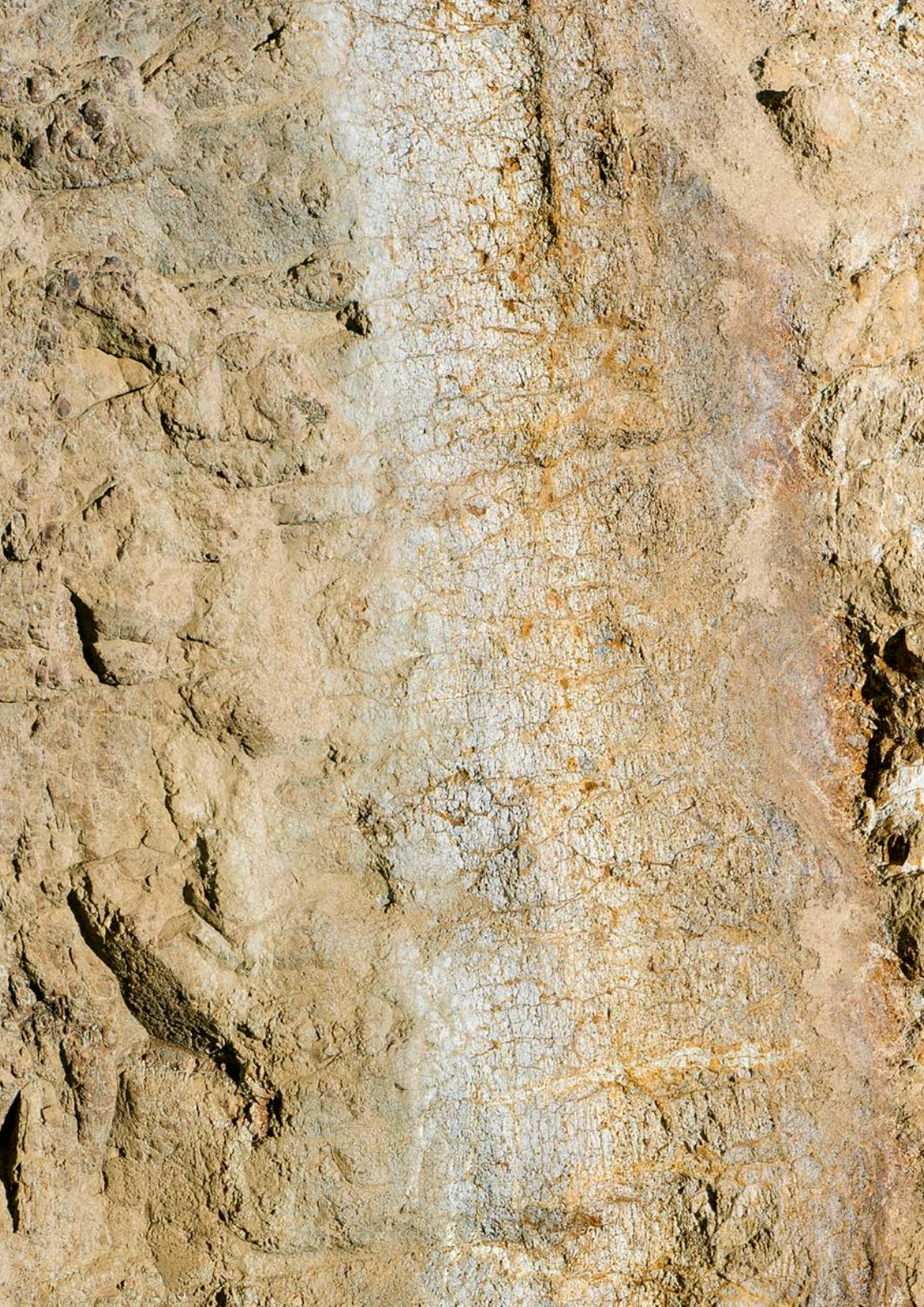
DESERT 9523, 2914, 2928, 5402, 2021