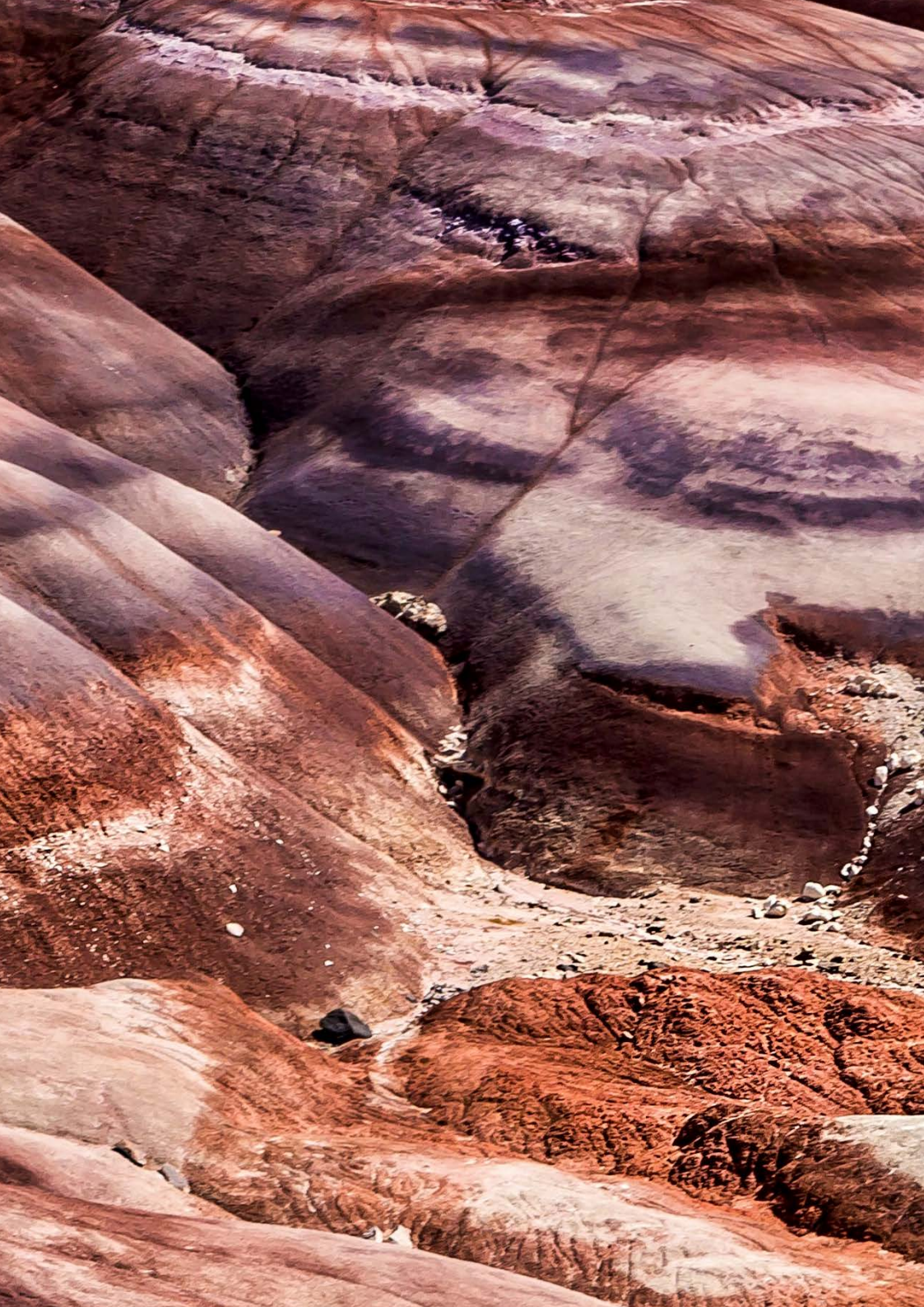
DESERT 4413, 9093, 5121, 1914, 2117