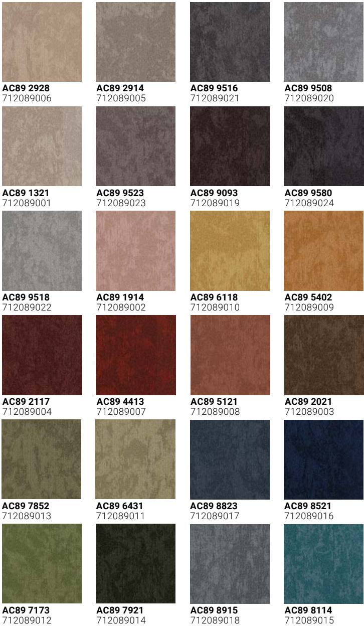
DESERT 5121, 2117