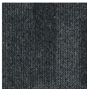
Essence Maze 9512