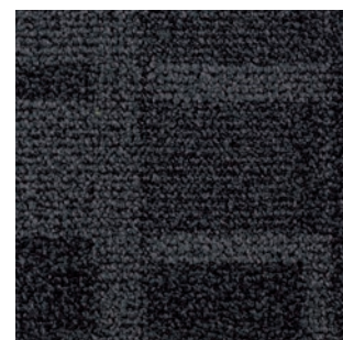
Essence Maze 9990*