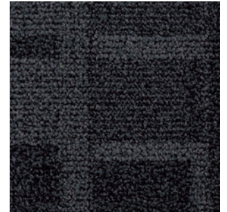
Essence Maze 9991*