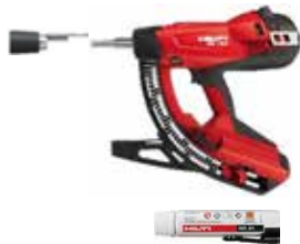
1. Gas actuated direct fastening