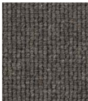
Eighty Eight 5088