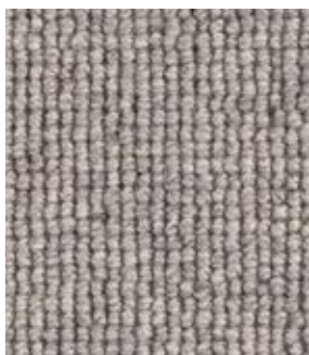
Twenty Three 5023