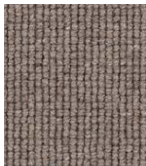
Forty Five 5045