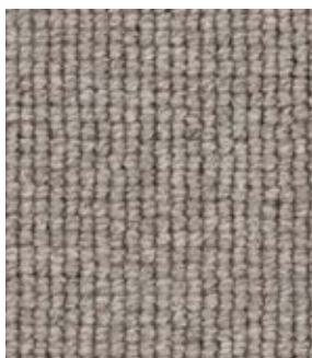
Twenty Eight 5028