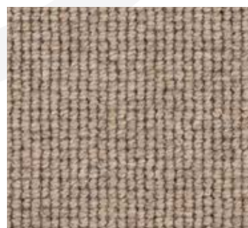
Forty Seven 5047