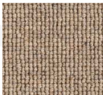
Fifty Four 5054