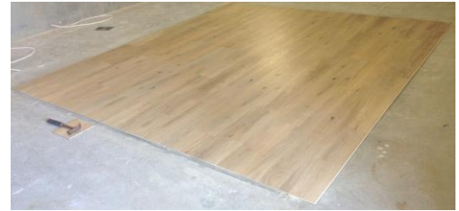
Test specimen installed in laboratory for test.