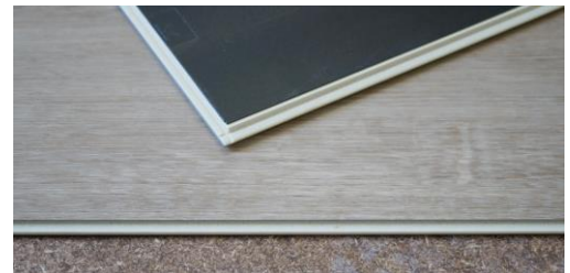
Close up view, showing face, backing and edge profile.