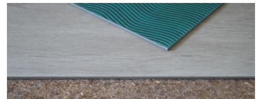
Close up view, showing face, backing and edge profile.