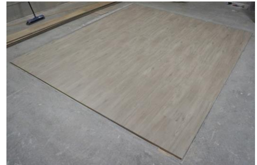
Test specimen installed in laboratory for test.