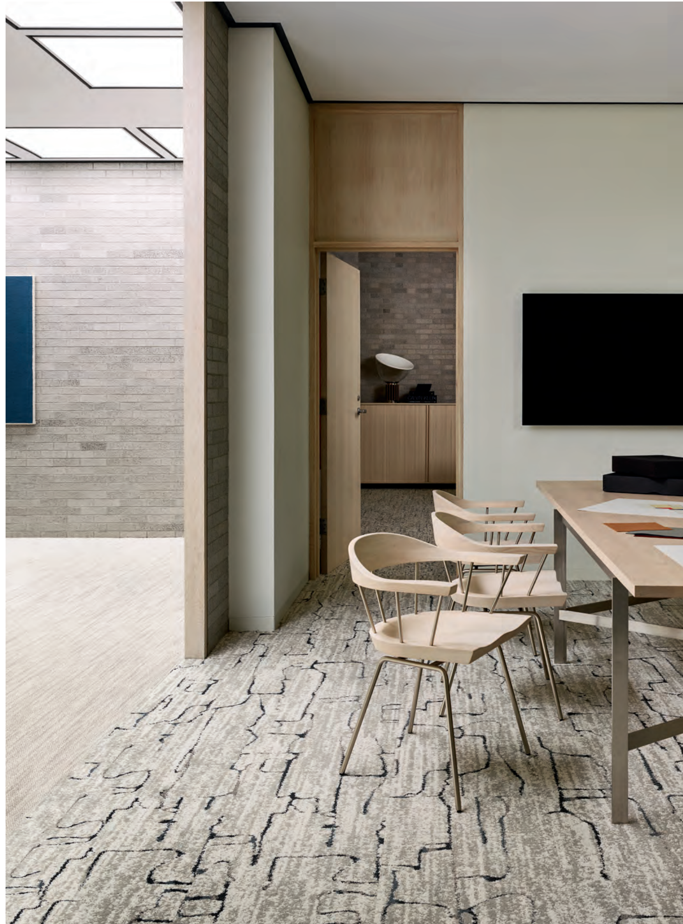
PROCESS (CARPET TILE 5T302) IN ARGAN (01100) AND HEDDLE (CARPET TILE 5T320) IN ARGAN (01100) | INSTALLED STAGGER