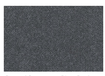
Poured Strataworx River Rock