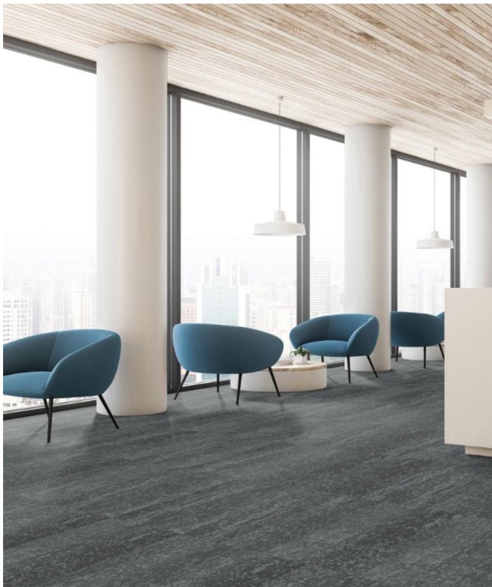
Pictured above: Observe, EcoWorx ® Carpet Tile with EcoSolution Q100 ™ Face Fiber for Shaw Contract ® .