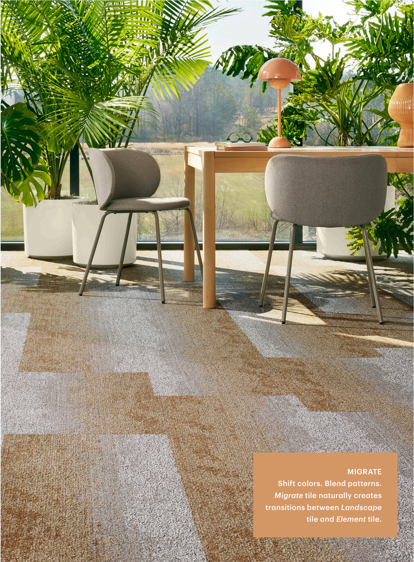
COVER: LANDSCAPE (CARPET TILE 5T604) IN COASTAL (04105) + COASTAL SAND (04668) AND ELEMENT (CARPET TILE 5T605) IN COASTAL (04105) + COASTAL SAND (04668) AND MIGRATE (CARPET TILE 5T606) IN COASTAL SAND (04668) | INSTALLED CUSTOM MONOLITHIC ABOVE: MIGRATE (CARPET TILE 5T606) IN COASTAL SAND (04668) | INSTALLED STAGGER

Local Landscapes is a carpet tile collection manufactured with EcoSolution Q100™, a high performance 100% recycled content nylon fiber, allocated from pre-consumer sources. Products with EcoSolution Q100™ are optimized for low embodied carbon and are carbon neutral.