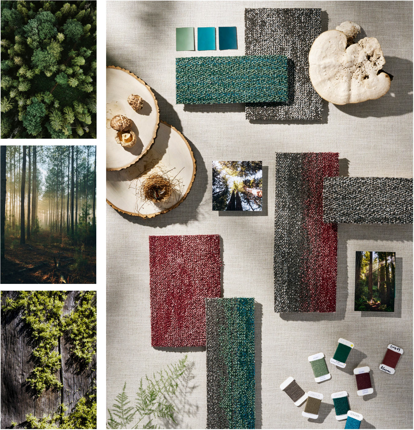
FOREST BIOME IN COLOURS FOREST (04585) + FOREST CANOPY (04323) + FOREST REDWOOD (04850) + CANOPY (04323) + REDWOOD (04850)

Temperate, boreal, tropical. Cool and primeval. Cleaning the air. Breathing life into the ground below.