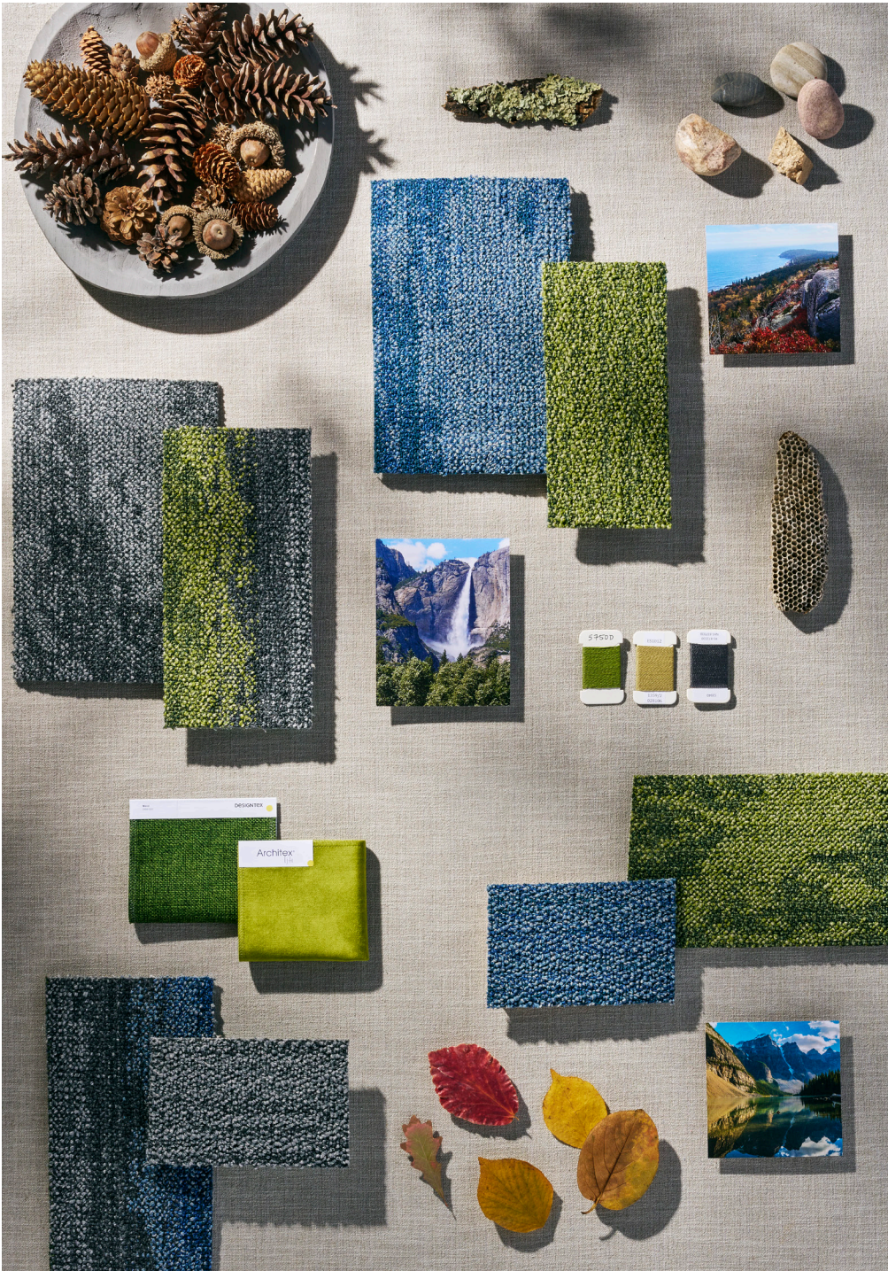
MOUNTAIN BIOME IN COLOURS MOUNTAIN (04580) + MOUNTAIN MOSS (04375) + MOUNTAIN LAKE (04486) + MOSS (04375) + LAKE (04486)

Everchanging elevation creates changes in the air and underfoot. Ancient rock, reaching the sky in a long goodbye to the sea.