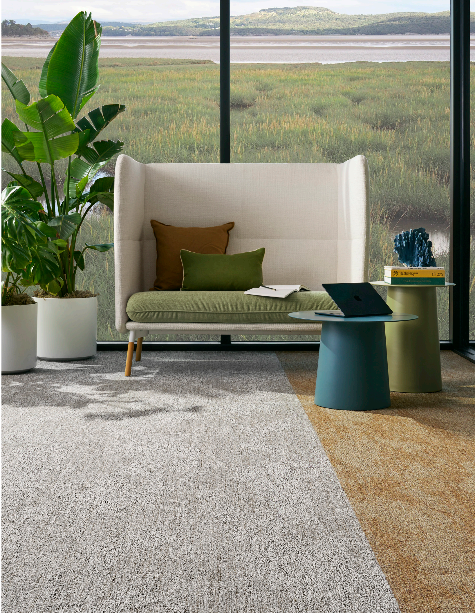
ABOVE: LANDSCAPE (CARPET TILE 5T604) IN COASTAL (04105) | INSTALLED STAGGER RIGHT: LANDSCAPE (CARPET TILE 5T604) IN COASTAL (04105) + COASTAL SAND (04668) | INSTALLED STAGGER

An abstract organic pattern ebbs and flows in Landscape tile. Understated texture meets foundational softness in any local landscape.