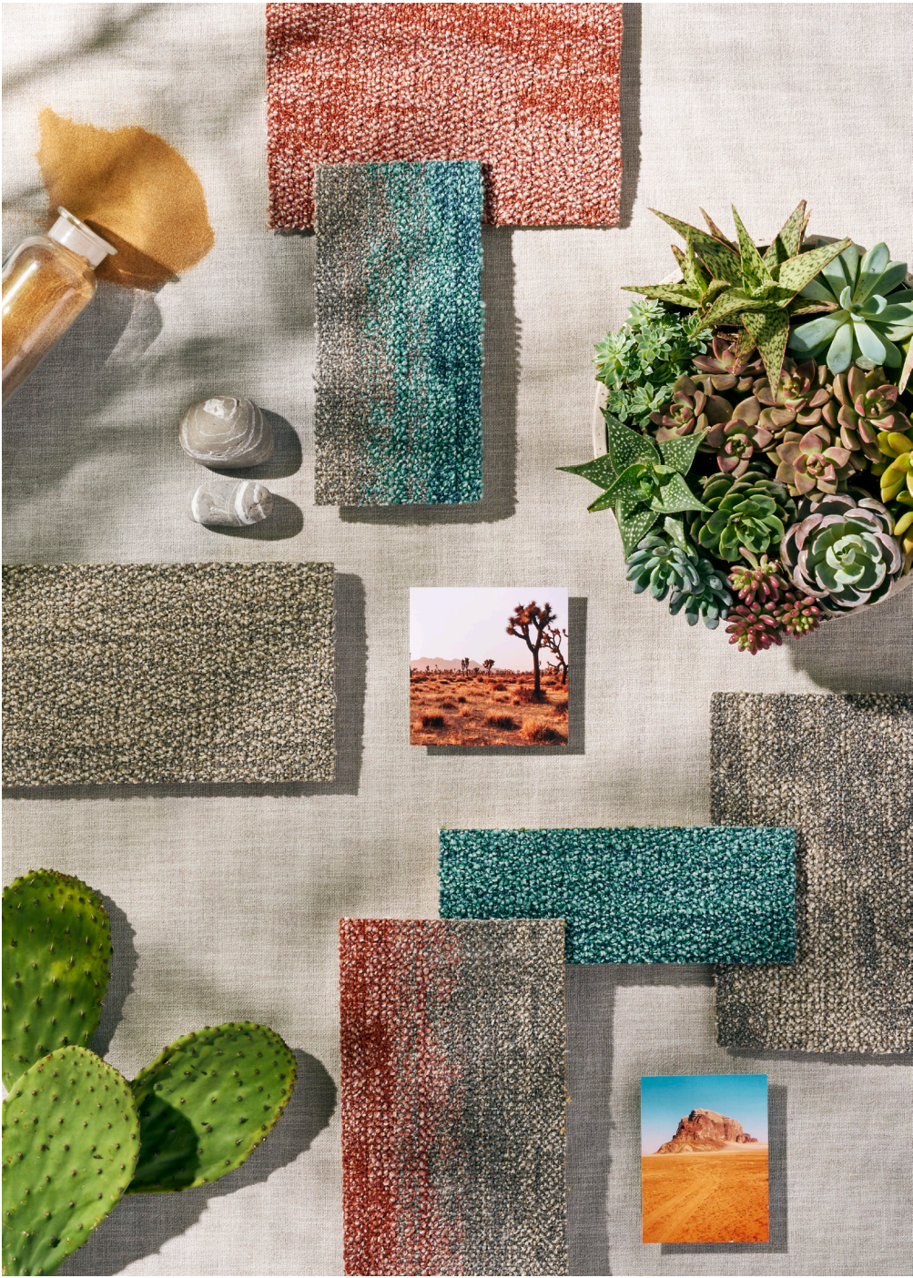
DESERT BIOME IN COLOURS DESERT (04518) + DESERT OASIS (04327) + DESERT CLAY (04675) + OASIS (04327) + CLAY (04675)

The hottest days. The coldest nights. Vast, ephemeral horizons. Dunes, rugged canyons and oasis.