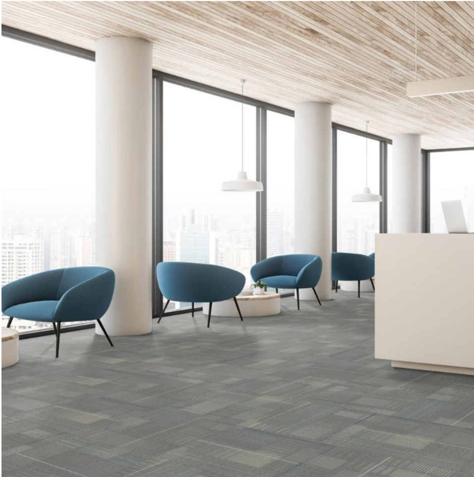
Pictured above: Diffuse, StrataWorx ® Carpet Tile with EcoSolution Q100 ™ Face Fiber for Shaw Contract ® .