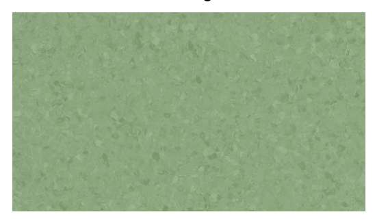
Premium and Plus flooring

The following figure shows an example of Premium and Plus flooring: